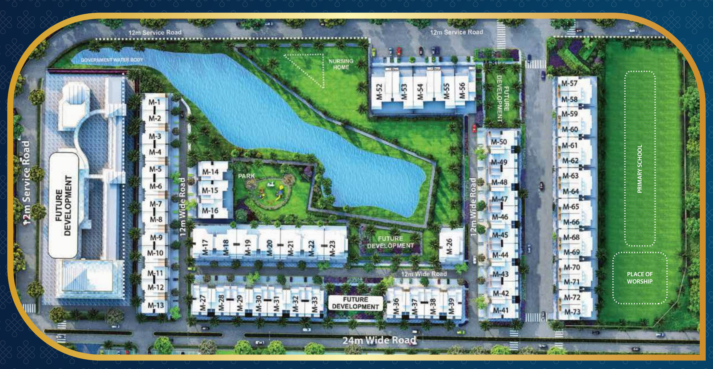
Artist's impression - Not an actual image.