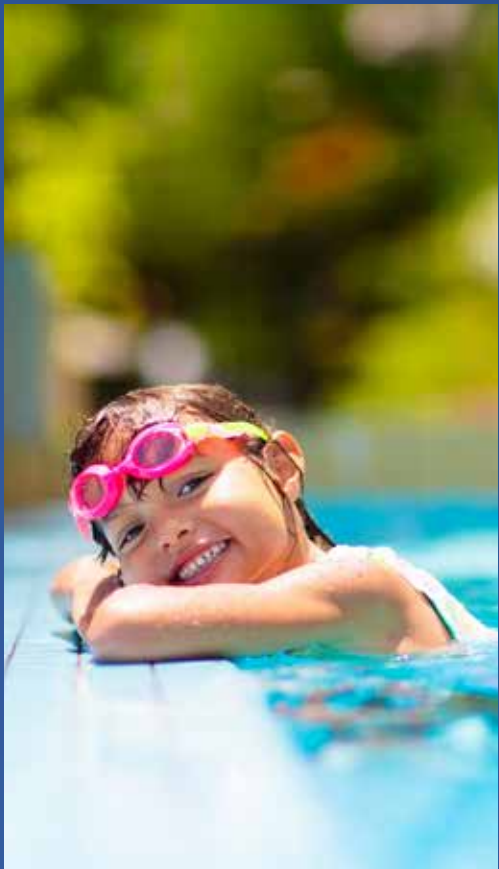
Kids Pool For Fun Water Activities

◆ Create unforgettable memories with your loved ones