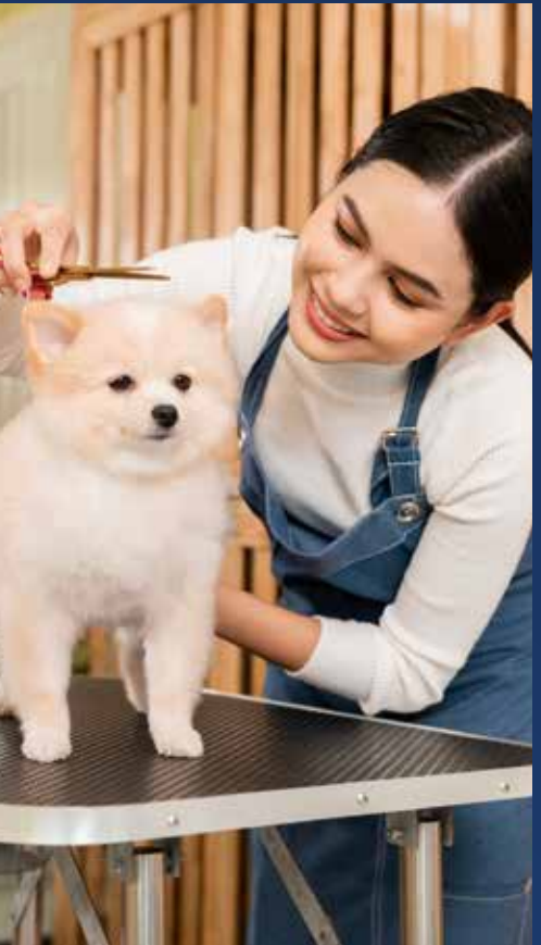
Dedicated Pet Spa To Pamper Your Furry Companions