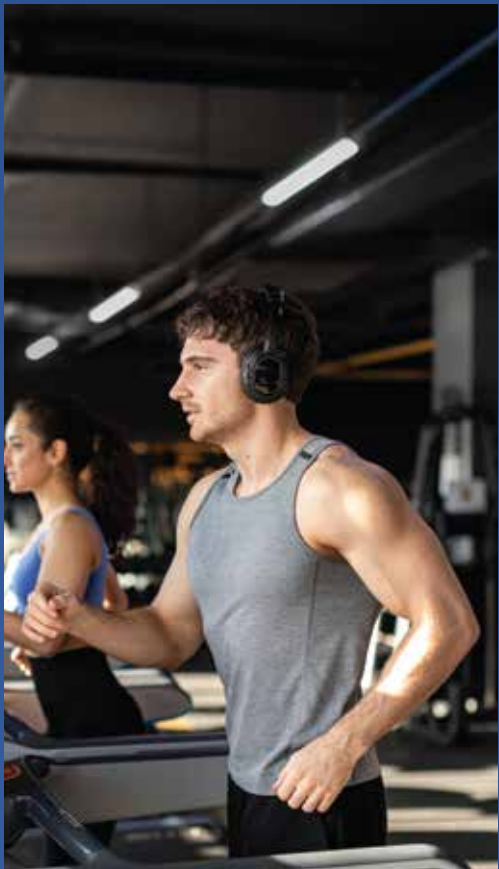
Fully Equipped Gymnasium

◆ ————— Elevate your well-being with state-of-the-art fitness amenities