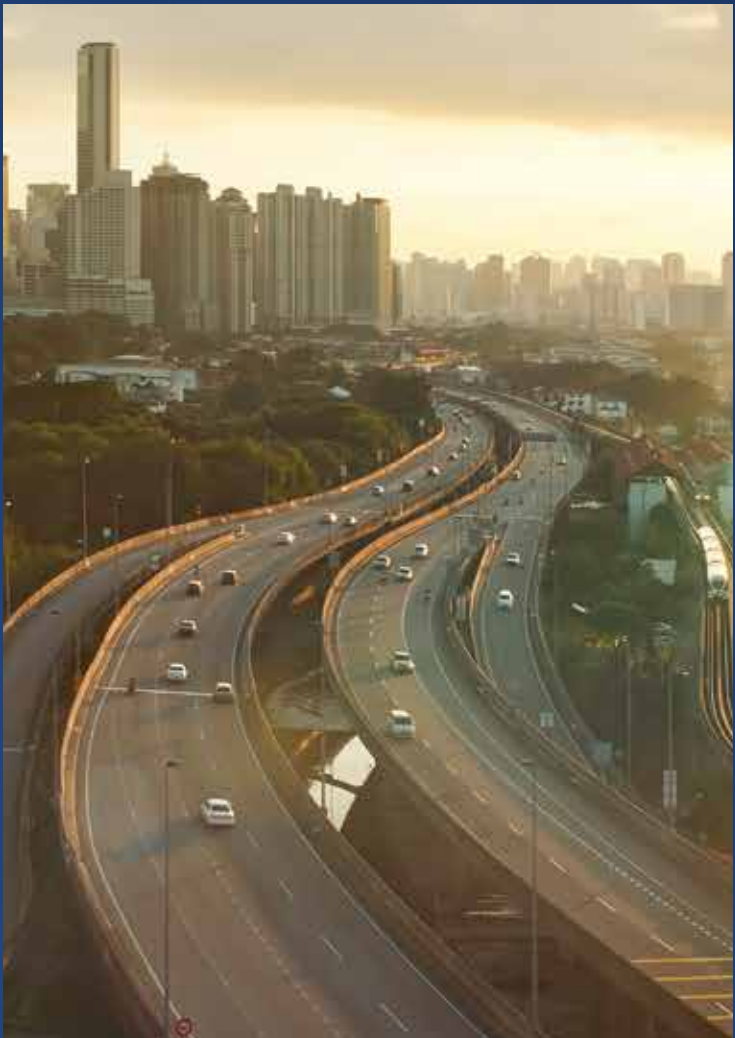
Eastern Express Highway Upgrades

Eases congestion at Teen Hath Naka by doubling lanes from 4 to 8.