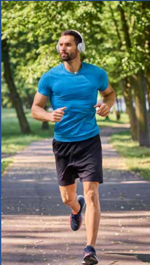
Jogging Track Amidst Lush Greenery