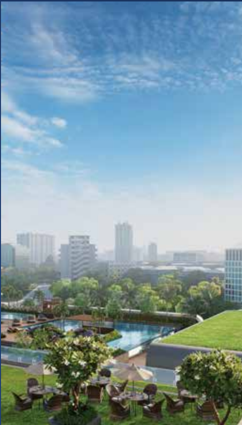
Event Lawn For Celebrations