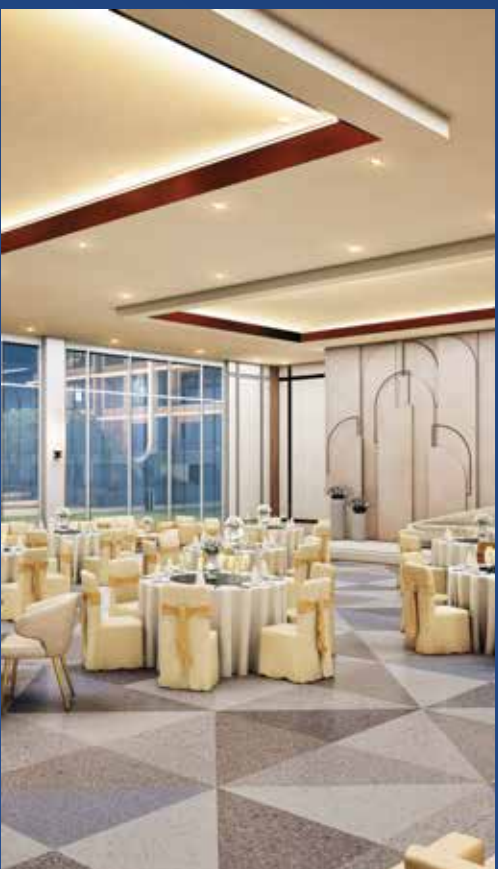
Banquet Spaces For Special Occasions