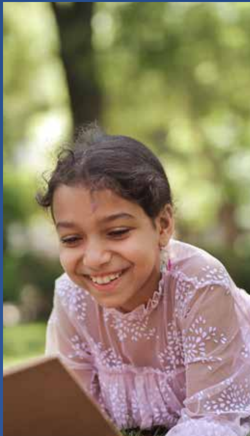
Creche To Ensure Your Child's Care