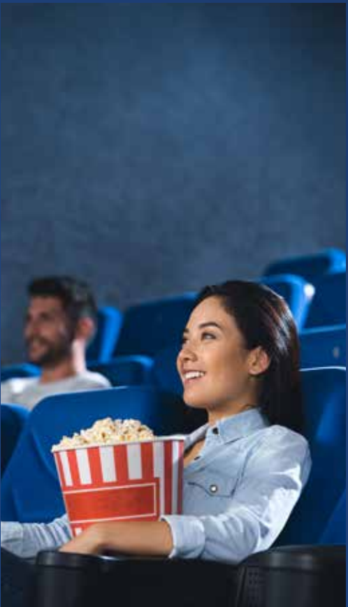
Mini Theatre For Movie Nights

◆ ————— Immerse yourself in unparalleled leisure experiences