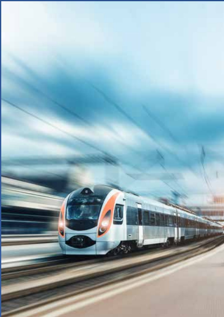
Thane - Wadala Metro Line 4

Strategically positioned at Teen Hath Naka, Codename LIT places you at the heart of Thane's transformation. With exceptional connectivity via major highways, metro lines, and railway access, it ensures effortless commutes while keeping you close to business hubs, retail destinations, and nature retreats.