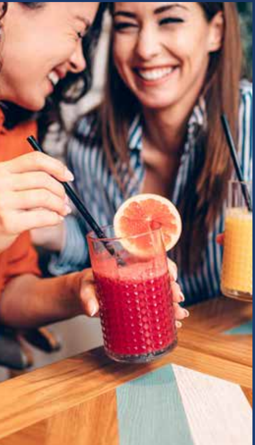
Juice Bar For A Refreshing Break