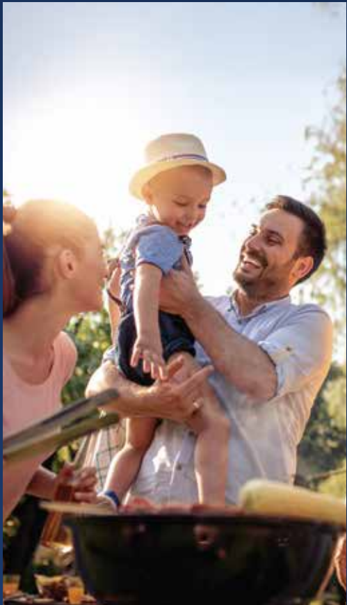
Bbq Trellis For Delightful Culinary Evenings