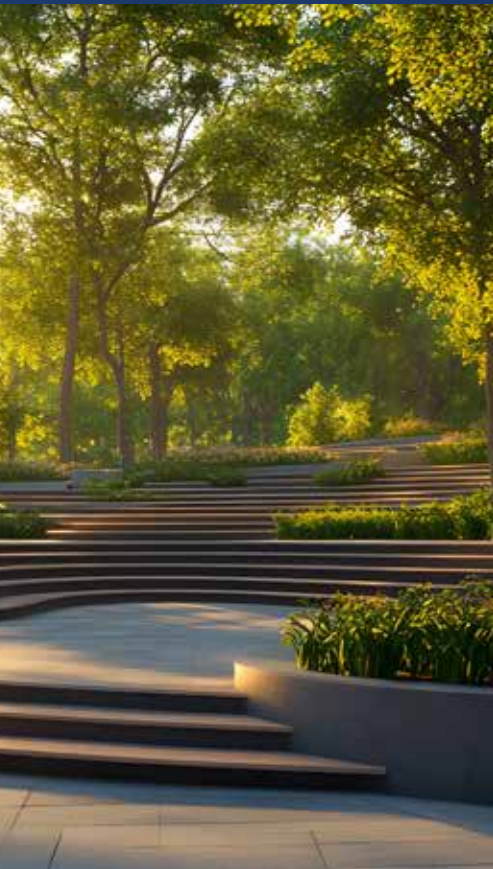
137-Seater Amphitheatre For Cultural Performances