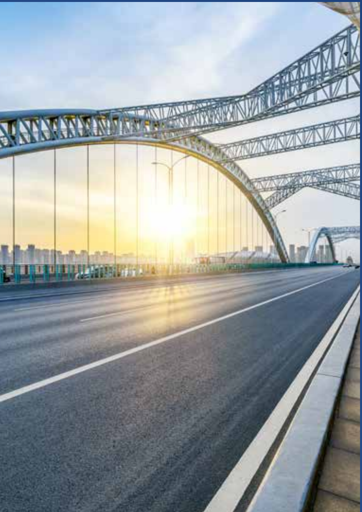
Kopri Bridge Widening

Enhances connectivity with a metro station near Teen Hath Naka.