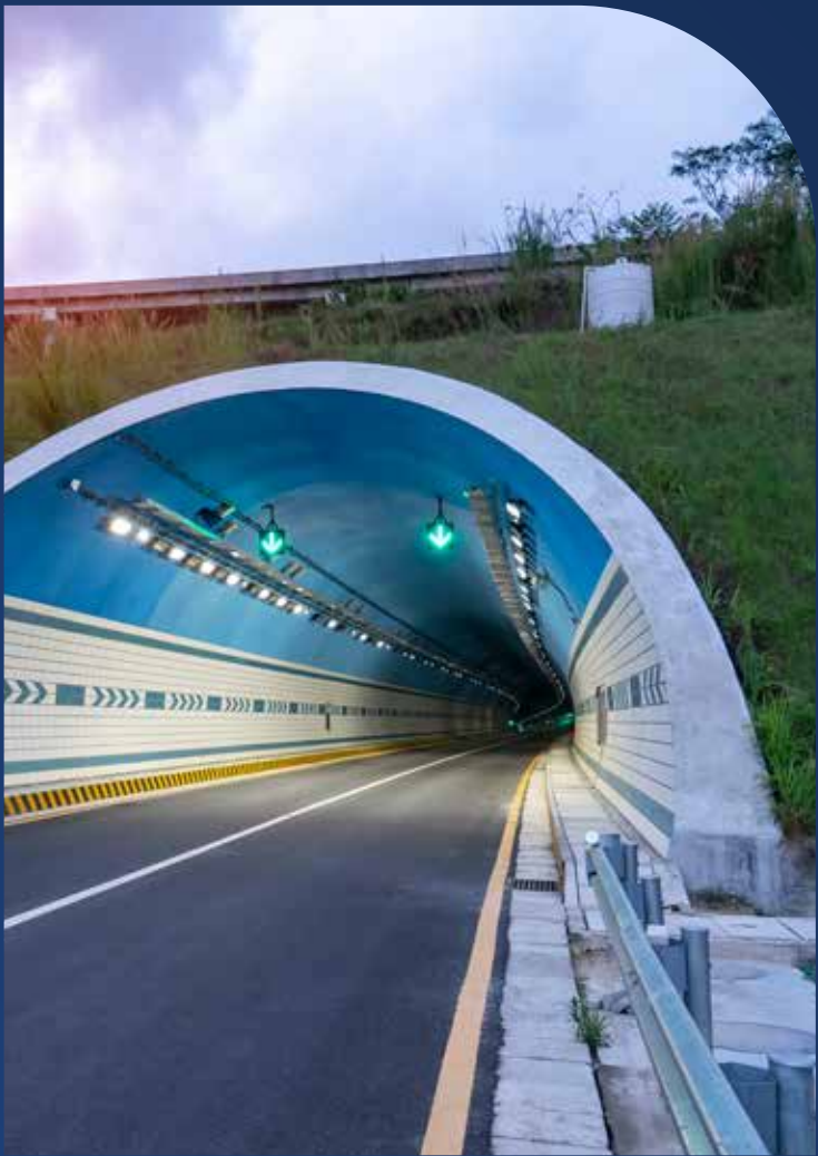
Thane - Borivali Underground Tunnel

Reduces travel time with a direct link near Teen Hath Naka.