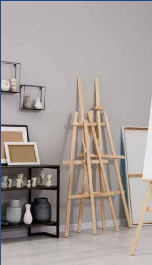
Hobby Rooms For Creative Pursuits